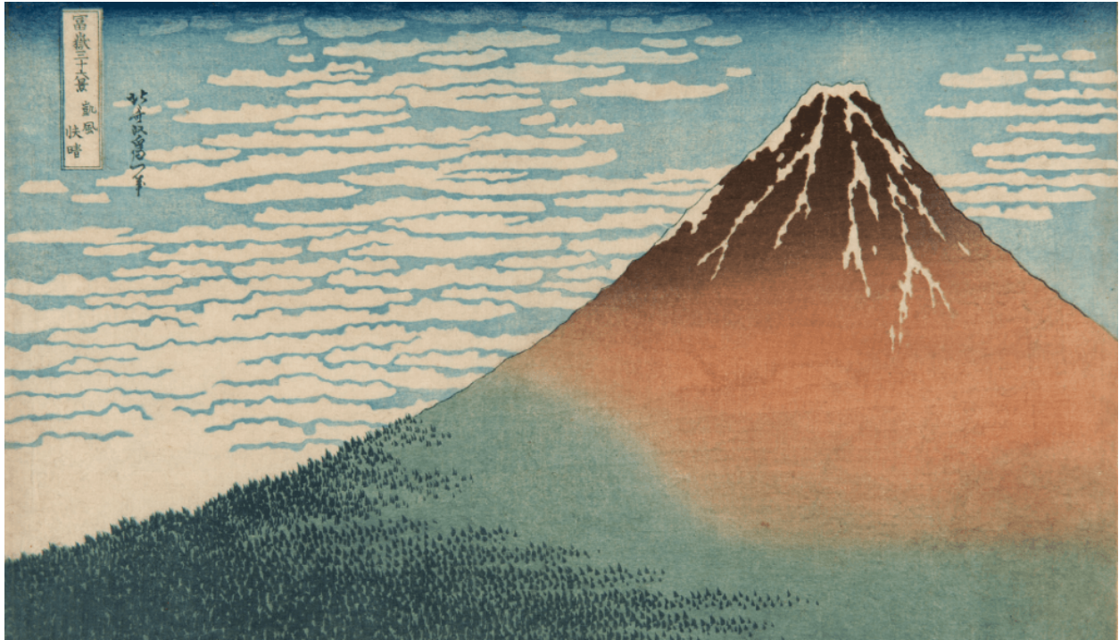
South Wind, Clear Dawn (Gaifu kaisei) from the series Thirty-Six Views of Mount Fuji (Fugaku sanjūrokkei) (detail), c. 1831–33, by Katsushika Hokusai (1760–1849). Color woodblock print, Gibbes Museum of Art, Read-Simms Collection

Perhaps the best-known Japanese art form outside of the country since its doors reopened to the world in the 1850s, Japanese woodblock prints immediately captivated European and American audiences. The bold bright color schemes, novel vantage points, and audacious compositions with off-center subjects were a revelation to Westerners who were struck by the supreme artistry of these everyday objects.