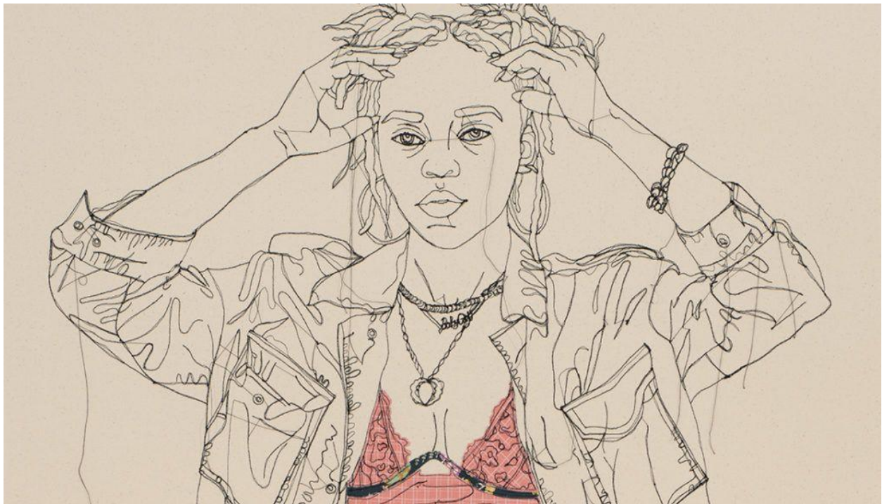
Gio Swaby, Pretty Pretty 8 (detail), 2021, Thread and cotton fabric on Muslin, Museum purchase in honor of James G. Sweeney

On the heels of the successful debut solo museum exhibition of multidisciplinary artist Gio Swaby (b. 1991, Nassau, Bahamas) at the MFA, the Art Institute of Chicago will open Gio Swaby: Fresh Up on April 8, 2023. This exhibition, co-organized between the Museum of Fine Arts, St. Petersburg and the Art Institute of Chicago, features bodies of work by Gio Swaby spanning 2017 through 2021. Employing the portrait genre and a range of textile-based techniques, Swaby explores the intersections of Blackness and womanhood. A fully illustrated catalogue, published by Rizzoli Electa, accompanies the exhibition and features an interview between Swaby and Pulitzer Prize-winning writer Nikole Hannah-Jones, as well