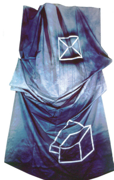
Nina Yankowitz, Draped Impotent Squares , 1969, Acrylic compressor spray on canvas

Exhibition Sponsorship at the Museum of Fine Arts, St. Petersburg provides patrons and corporate partners exclusive opportunities to deepen their engagement with the museum's mission while enjoying unique benefits including exclusive recognition , behind-the-scenes access , and invitations to special events .